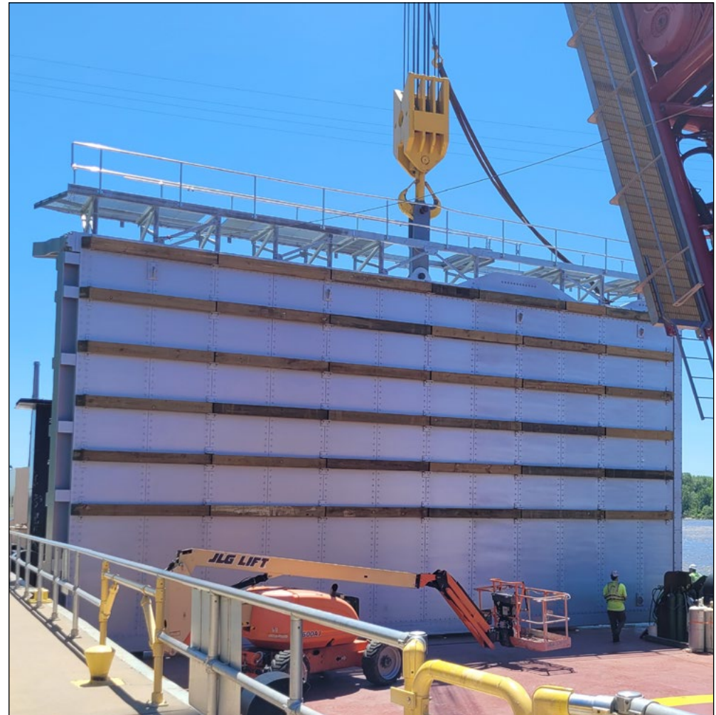
Maintenance and repair crews from the St. Paul and Rock Island Districts install a new 121-ton miter gate at Lock and Dam 8 near Genoa, Wisconsin, June 16.