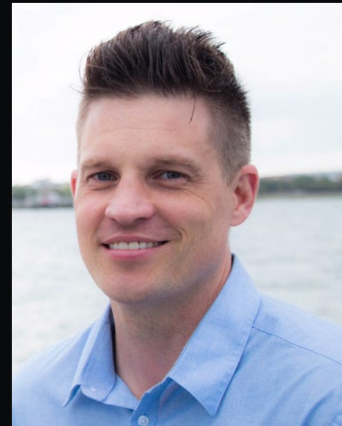
August Wade Carr Engineering and Construction