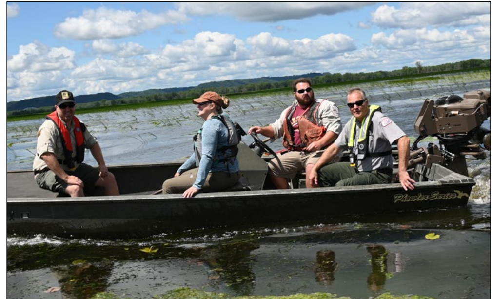
Corps and agency partners conduct a site visit at Big Lake in Lower Pool 4 near Wabasha, Minnesota, July 29.