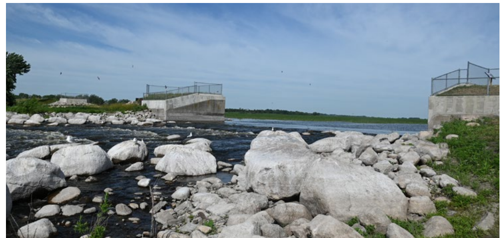
The Marsh Lake fish passage at Marsh Lake, near Appleton, Minnesota, July 14.