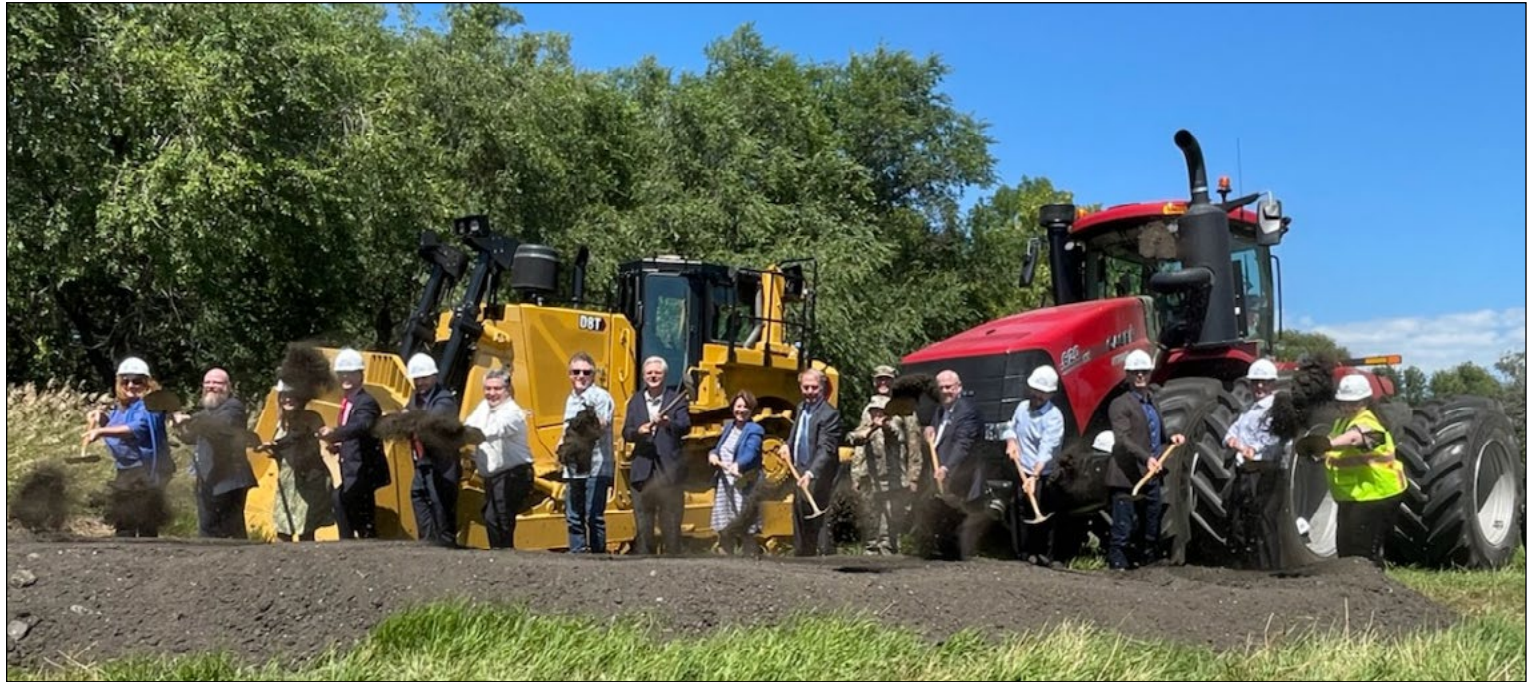
Corps senior leaders and elected officials shovel dirt at the P3 groundbreaking in Fargo, North Dakota, Aug 9.

"The communities of Fargo and Moorhead and the Army Corps of Engineers have a long history