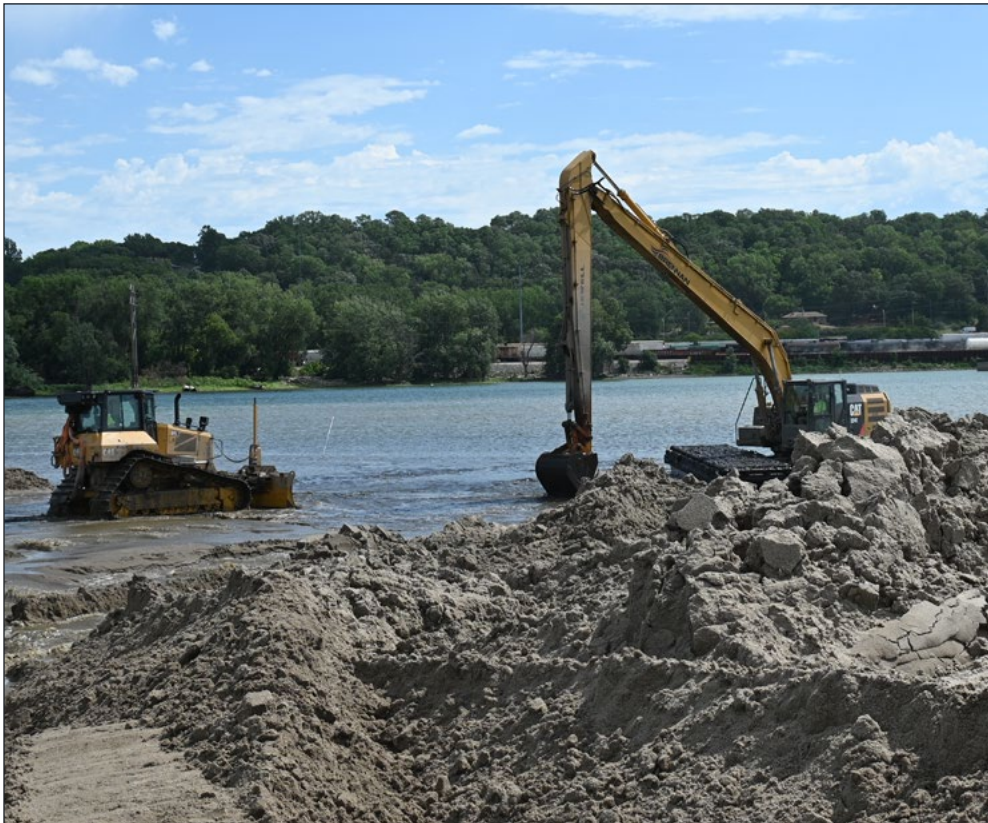
Construction operations at Pigs Eye Lake, near St. Paul, Minnesota, July 19.